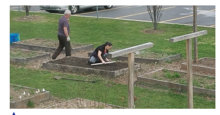
Franklin Park offers a "Community Garden" to our residents interested in planting and growing vegetables. It is located adjacent to Village Hall.