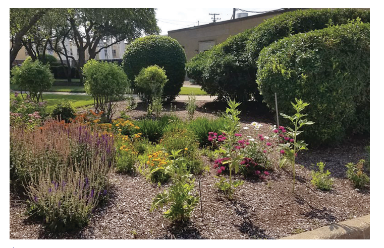
Thanks to a grant from the Illinois EPA and West Cook County Solid Waste Agency, the Village was able to plant new trees and to establish a butterfly garden west of the gazebo located at 9501 Belmont Avenue. Thank you for helping to beautify our town!