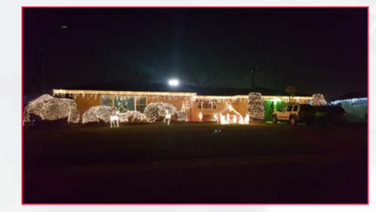
2nd Place 2724 Riverside St. Colon Family