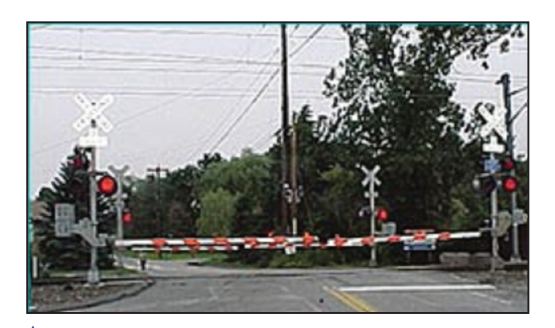
This is an example of a 4 quad gate.

In 2013, the Village met with the Regional Director of the FRA, to discuss the possibility of both villages attaining a quiet zone designation. Signal improvements have begun at the Ruby Street crossing to reduce the potential for entrapment on the railroad tracks and should be completed later this year. Last October, a Citizens Advisory Board (CAB) was established to assist in developing safety measures that would best work for the Village. Additionally, the Village hired Hancock Engineering to develop the quiet zone program.