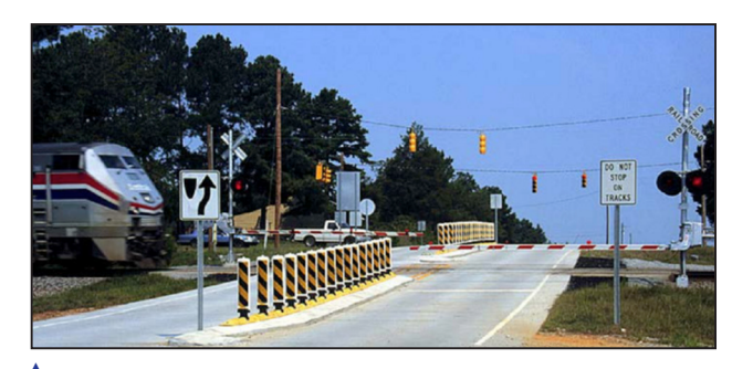
An example of a channelization devise proposed for use by the Citizens Advisory Board.

The Village of Franklin Park, in partnership with the Village of River Grove, is moving forward with establishing a quiet zone from the Scott Street grade crossing to Thatcher Avenue. A quiet zone is a designated section of railroad where train horns are not used. This designation requires specific steps to attain a quiet zone, including completion of safety measures mandated by the Federal Railroad Administration (FRA) to stop the requirement for trains to use their horns as they approach the grade crossings.