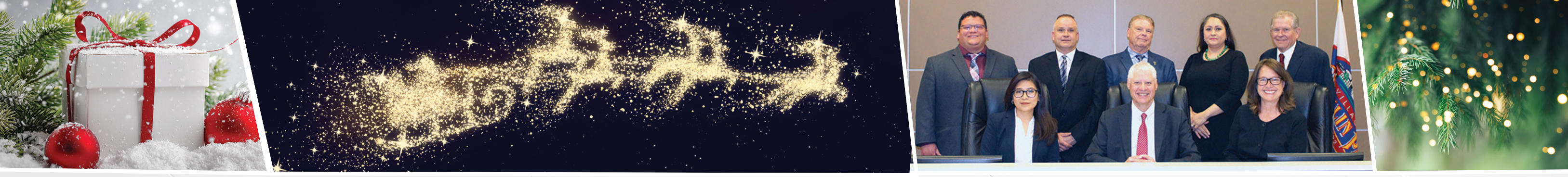
■ Mayor's Desk Continued from Page 1.