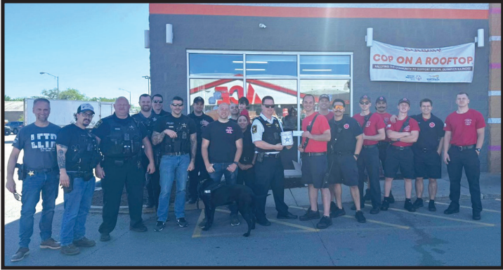
▲ The Police Department raised $ $3,479 during the Cop on a Rooftop event at the Grand Avenue Dunkin' location. Everyone who donated got a free donut with all proceeds going to the Special Olympics Illinois.