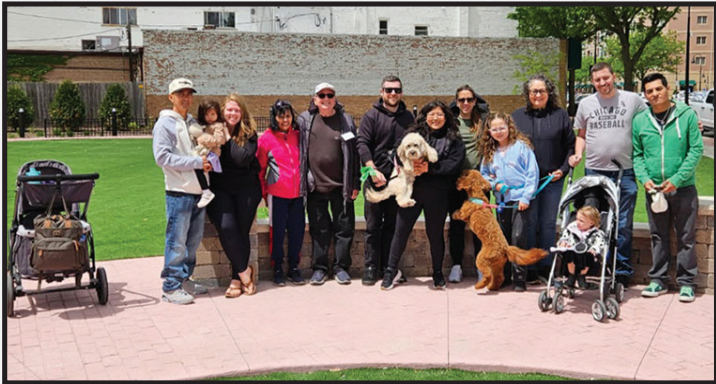
▲ Thank you to everyone who participated in our Arbor Day Walk last weekend. A special thank you to our friends at Sage Artistry for the charcuterie board, Baranowski Bakery & Deli for the paczkis, and Crave It for the tea samples and protein bites. We will do more community walks soon!

Before you head over to the Fest, consider stopping by the Community Room to donate blood! Donating blood is safe, easy, and most importantly, it can save a life. If you are able, please donate to the Village’s Community Blood Drive on Friday, June 13 from 3 until 7 PM at the Franklin Park Police Station. Remember to eat a healthy meal and to stay hydrated before donating.