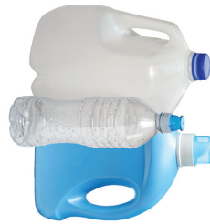
Plastic Bottles & Jugs Botellas y recipientes de plástico