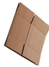
Flattened Cardboard Cartón aplastado

COLOQUE sólo estos artículos en el contenedor de reciclaje