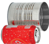
Metal Cans Latas de metal