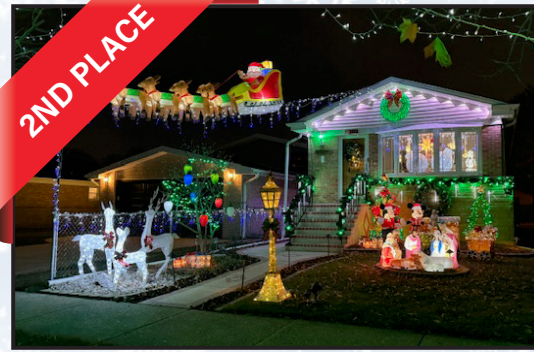
The Ventrella Family 3510 Dora Street