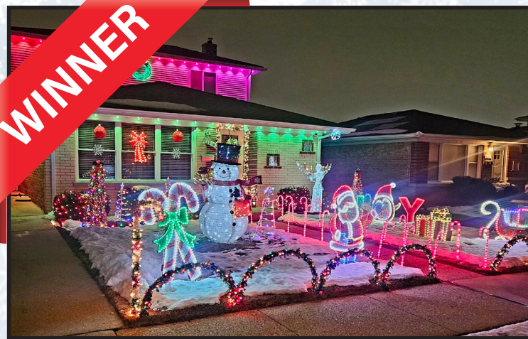
The Sanabria-Figueroa Family 2416 Lincoln Street