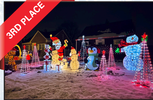
The Garcia-Figueroa Family 2740 Elder Lane