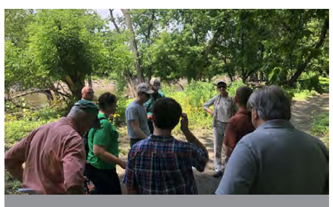
Trail research with Christopher B. Burke Engineering and the Forest Preserve District of Cook County.

The preferred route alternative aims to revitalize the archaic bridle path from Touhy Avenue in Park Ridge to North Avenue in Melrose Park. Additionally, the path will be extended to a new terminus at the Illinois Prairie Path in Maywood. The Des Plaines River Trail Improvements project has so far received $721,000 of STP funds allocated from the North Central Council of Mayors, $240,000 from the Cook County "Invest in Cook" grant, $1,030,000 from the West Central Municipal Conference, and $100,000 from the Chicago Community Trust. Together, these contributions have funded Phase I engineering and planning undertaken by Christopher Burke Engineering of Rosemont.