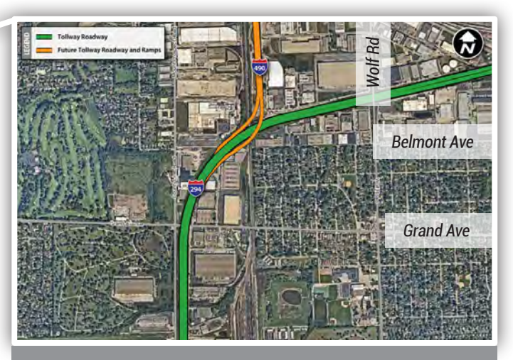
Map of the I-490/I-294 Interchange Project

The improvements delivered through both projects by 2025 are expected to enhance economic development and travel performance in the region, solidifying the Village of Franklin Park as a central point of access to and through the region.