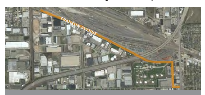
The Franklin Avenue Reconstruction and Widening Project will allow for safer, more efficient travel with improved connections to Mannheim Road and the Illinois Tollway system.

The $784,000 from CMAQ will be utilized as additional funding for the reconstruction of Franklin Avenue from Runge Street to Williams Drive and through to Belmont Avenue to Mannheim Road. Recognized as a high priority, the project previously finished first in the state for the Department of Transportation's Competitive Freight Program which resulted in a $22,960,000 grant award. Additional funding commitments came from the "Invest in Cook" grant, awarded by the Cook County Department of Transportation and Highways for $340,000 and from the North Central Council of Mayors for $2,040,000 for the Phase I and II engineering. In total, the $31 million project will provide much needed improvements to Franklin Avenue, creating more efficient traffic flow, improved public safety, and the ability to accommodate future demand as regional redevelopment occurs.