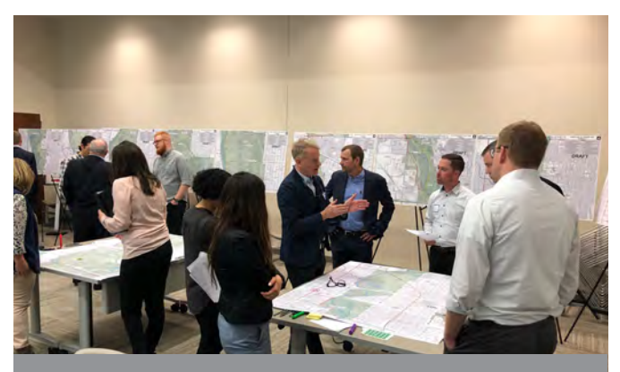
Trail Advisory Group Members discuss route findings during a roundtable exercise with Christopher B. Burke Engineering.

The Des Plaines River Trail Improvements Project took another step forward last year as a diverse selection of community, municipal, and county organizations agreed on a preferred route alternative for the Des Plaines River Trail. The plan—which aims to fix years of chronic flooding, disrepair, and unsafe road crossings—will undergo a public comment period before moving into phase II planning later in 2020.